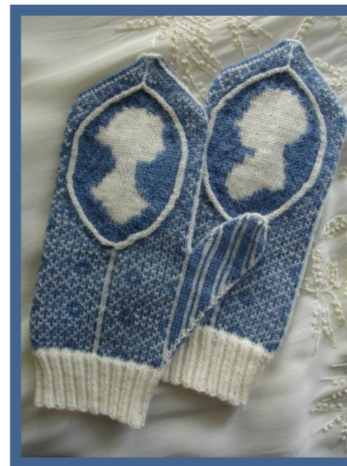
Chawton Mittens

431 Oregon Street—Hiawatha, KS 66434 785-742-3831