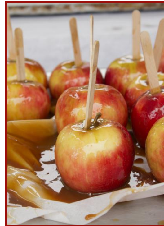
Caramel Apples

431 Oregon Street—Hiawatha, KS 66434 785-742-3831